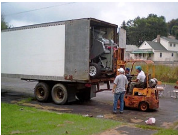
The last item on this shipment was a threshing machine for the farmers in Honduras.