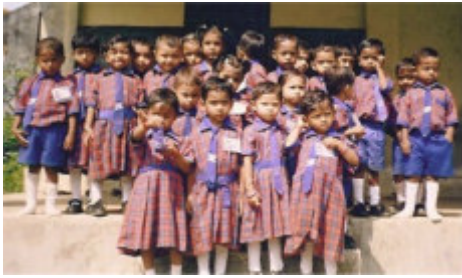
Logos Nursery School in Ahwa-Dangs