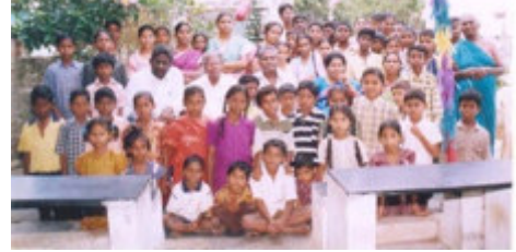
Orphanage/School in Guntur

In Ahwa-Dangs, India , after experiencing much persecution in the belt of poverty and tribal customs in 1998, the Christian community established "The Living Water Trust – Dangs" which provides them a greater opportunity to serve the Lord.