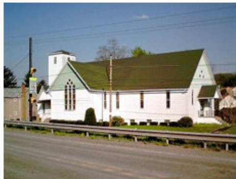
ICA headquarters in Jerome, PA

ICA is located in the former Lutheran Church building in Jerome, Pennsylvania. This building provides space for collection, storage and packing of material aid donated for our ministry, as well as offices for administration of the program.