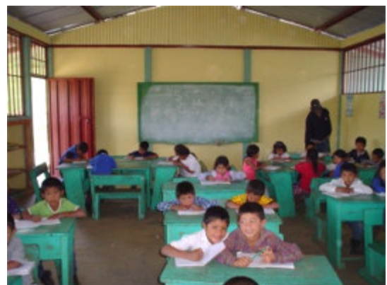
PGV is building one-room schools, giving many children the first opportunity to get an education.

International Christian Aid provides equipment and supplies for health clinics, schools, road building and the many agricultural programs, as well as financial aid to help develop these programs.